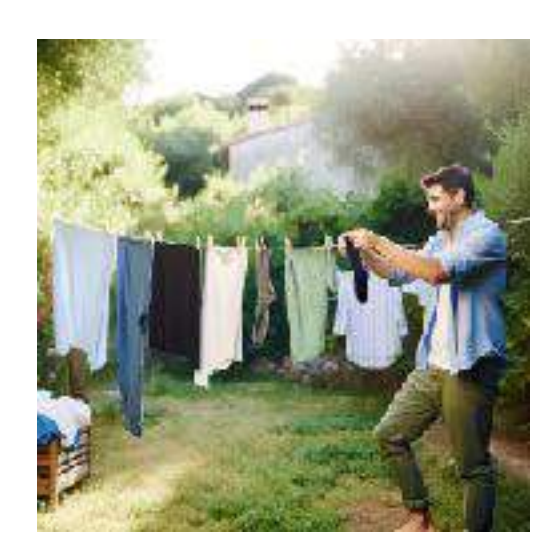
Answers at bottom of PDF

Why didn't I say anything to my neighbour who I saw stealing socks off my clothes line?